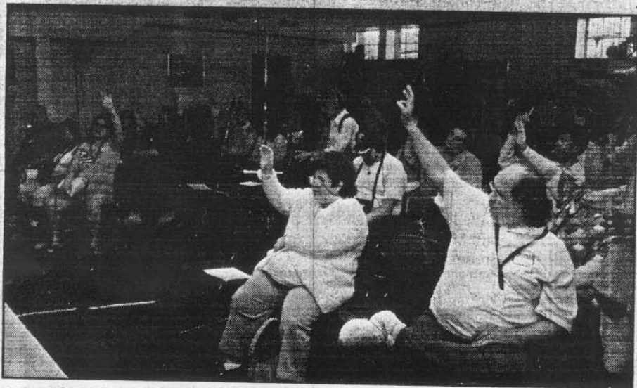
Most adult home residents in attendance raise their hands when asked if someone at their facility has been hospitalized for a heat-related illness.

For more information about CIAD, log onto www.ciadny.org or contact 212-481-7572.